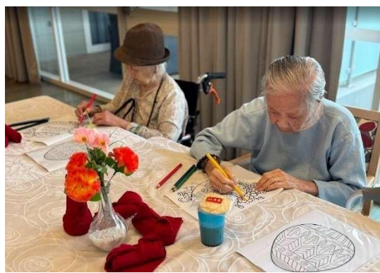
Residents spent time colouring the Easter Eggs printings, which is one of their favourite activities whenever Easter comes.