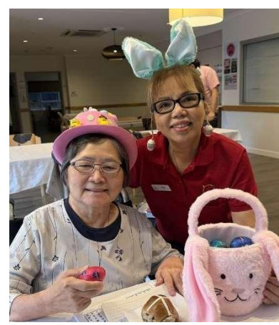
Residents and staff with lovely Easter bunny bands and hats were celebrating Easter 2025 together when residents had a great chance to have photos taken with Easter egg baskets and cross buns which are the traditional treats on this special occasion.