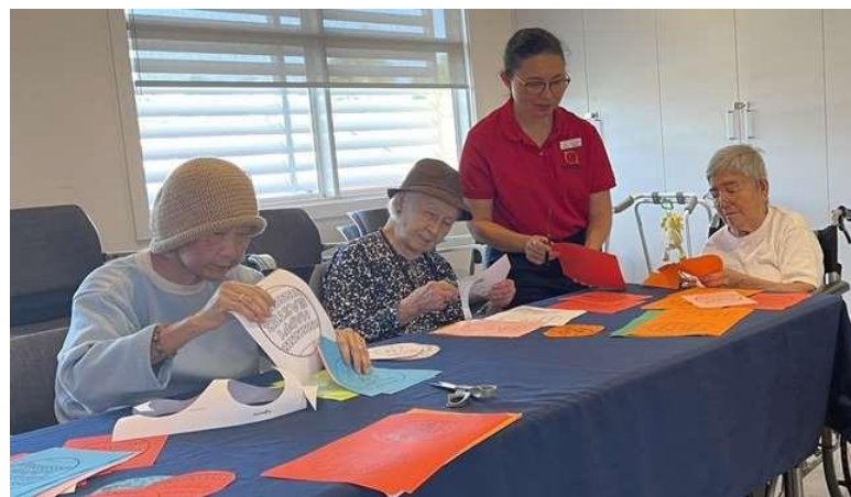
Residents on the handcrafting session to cut the Easter Eggs patterns for Easter Celebration 2025 at AVACS.

In addition to this, residents enjoyed colouring Easter egg designs, which were proudly displayed in the communal rooms of both wings on the ground level. To top off the celebration, residents had their photos taken with the RAO team and a charming Easter chocolate egg basket—each resident receiving a chocolate egg as a sweet keepsake of the day.