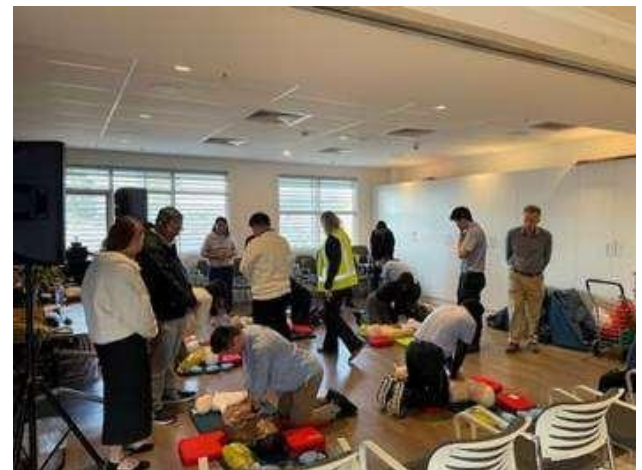
The Registered Nurses team members were on the CPR practical session of the First Aid Training at AVACS

AVACS staff have participated in mandatory, face-to-face onsite training sessions conducted by accredited contractors. These sessions covered Fire Safety and Manual Handling, ensuring our team is well-equipped to maintain a safe working environment and to deliver safe quality care to the residents. In view of the winter season, intensive education sessions are delivered to the care team on Infection Prevention and Control policies and procedures. In addition to face-to-face training and educational sessions, all staff are enrolled to complete online training modules delivered by AUSMED.